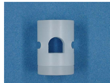
Holder for Sensor M18 - tube D.6.5, Nylon