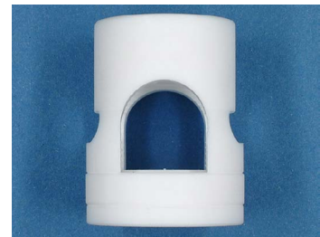
Holder for Sensor M30 - tube 3/4", PTFE