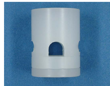
Holder for Sensor M30 - tube D 5.0, Nylon